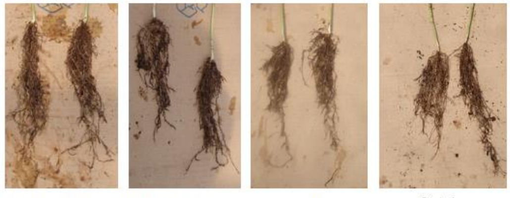
TSP/CAN + Trichodem a Trichodem as pp.

*Figures followed by the same letter are not significantly different according to Tukey's Honestly Significant Difference (HSD) test